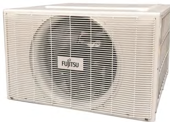
Outdoor unit models: AOUH09LEAS1 & AOUH12LEAS1