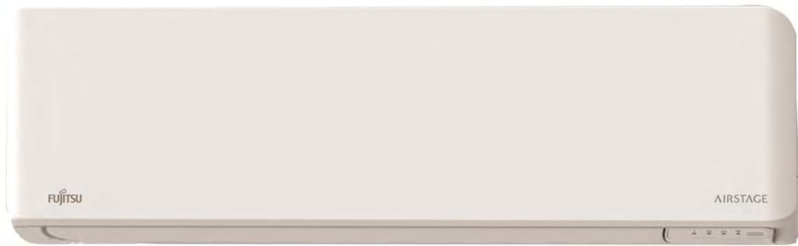
Indoor unit models: ASUH09LMAS & ASUH12LMAS