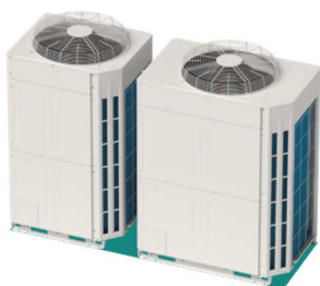
Conventional approach 6-ton and 10-ton models were combined.

* 3 During cooling operation. By the American standard of AHRI 1230 (including ceiling cassette type products), as of February 1, 2023. Based on research by Fujitsu General.