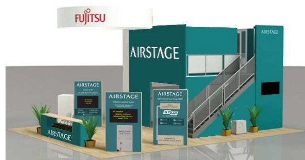
Fujitsu General's booth, designed based on the brand concept of AIRSTAGE (illustration)

The booth, designed using green and wood grain tones, expresses AIRSTAGE's worldview of pursuing symbiosis with the earth. The booth will also provide a space for customers to communicate while operating the wall-mounted air conditioner controller and AIRSTAGE Cloud. The space will further enhance Fujitsu General's brand value by offering the experience of comfort and excitement that can be felt through its products and services.