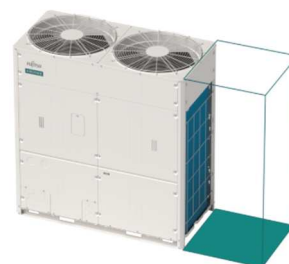
AIRSTAGE VU-V Up to 16 tons can be handled with a single model, reducing the footprint of the outdoor unit by 26%.