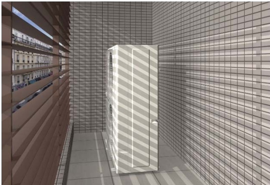
AIRSTAGE J-III L series model installed on a balcony covered by an external louver (Image)

In addition to changing the outdoor unit heat vent from a vertical blowing type to a horizontal blowing two-fan type, we have optimized the components such as our unique high density heat exchangers and kept the depth of the outdoor units to 480 mm. This has allowed us to achieve compact outdoor units that are the smallest in the industry* 1 in the 16 HP class. We have reduced constraints in construction by decreasing the installation area by approximately 45% compared to existing models and making it simpler to place in elevators when bringing these models into buildings. This has made it easier to install in places that do not directly catch attention, such as between buildings, in narrow spaces (e.g. balconies) and in places covered by external louvers. Furthermore, these models can also be installed in places with external louvers to support blowing resistance up to 60 Pa for the static pressure. With these efforts, we have expanded the choices of installation layout for small shops and offices and increased the degree of freedom in terms of facility design.