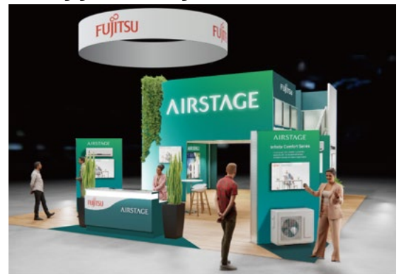
Image of our booth